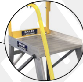
Large platform for extra comfort