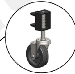
Large 100mm castor repositioned for stability