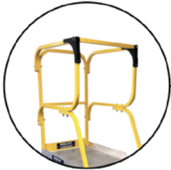
Safety gate included as standard

The new Bailey Order Picking Platforms are packed with features making working at heights safer, easier and more efficient. The Bailey Order Picking Platforms make stock picking a breeze.