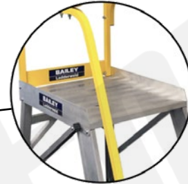
Large platform for extra comfort