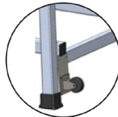
Rear tilt castor included. Choose to fit or not