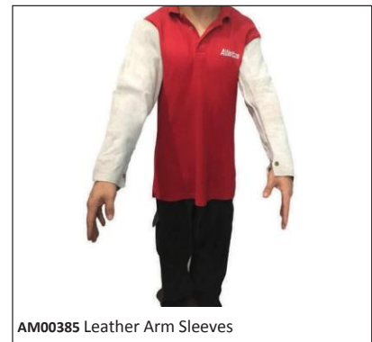
AM00385 Leather Arm Sleeves