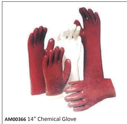
AM00366 14" Chemical Glove