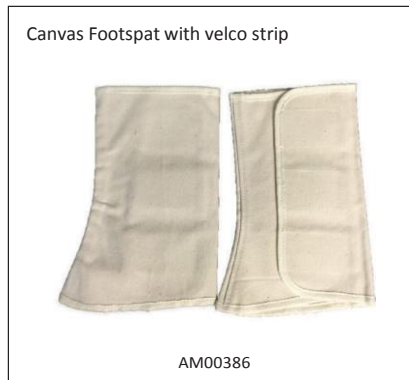
Canvas Footspat with velco strip