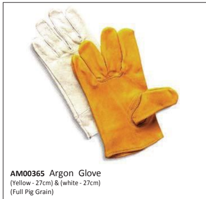
AM00365 Argon Glove (Yellow - 27cm) & (white - 27cm) (Full Pig Grain)