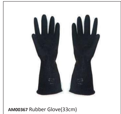
AM00367 Rubber Glove(33cm)