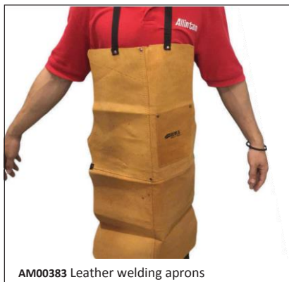
AM00383 Leather welding aprons