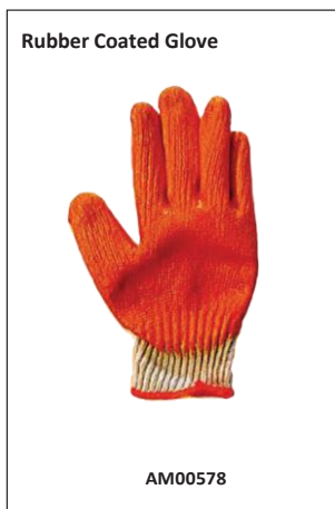
Rubber Coated Glove