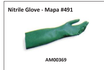
Nitrile Glove - Mapa #491