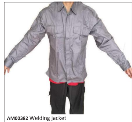
AM00382 Welding jacket