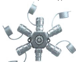
L-20A AF00646 L-30A AF00647