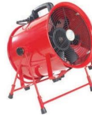
AP-206 200mm/8" AS00756 AP-306 300mm/12" AS00757