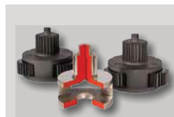
alkitronic® - power gear components

alki TECHNIK GmbH reserves the right to change specifications without prior notice.