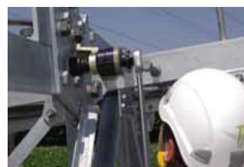
alkitronic® M operating on electricity pylons. Accurate tightening via torque wrench.