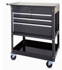
A3334A 4 Drawer Service Cart