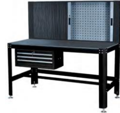
WBTS Work Bench C/W Tool Stand