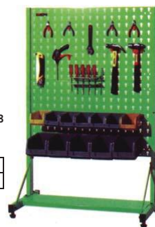
RTS-S2P Tool Stand