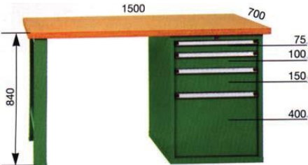
N-WSB 150/80 Work Bench