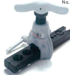
No. 458MM Fla ring Tool