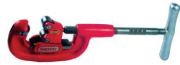
Nos. 1-A & 2-A AH32810

Fast, Clean pipe cutting by hand or power. Extra long shank protects adjustment threads, while an extra-large handle is provided for quick, easy adjustment. Can be converted to 3-wheel cutter by replacing rollers with cutter wheel, or can be ordered as 3-wheel model for use in areas where a complete turn is not possible.