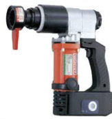
GSR 52E AC01192