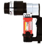
GM 302EZ AC00990