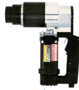
GM 242EZ AC00989