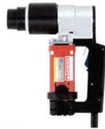
GM 222EZ AC00991