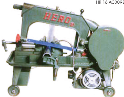
HR 14 AC00980 HR 16 AC00981