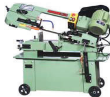
RF 712 AC00982 RF 916 AC00983